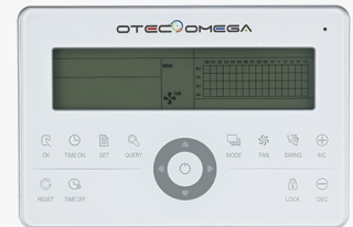
Centralized Controller VAECR-D064T (Optional)