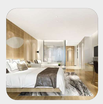
AIRBNB / Hotel Room